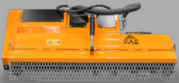
Mulcher with hammer/flail rotor for RCU75