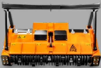
Forestry mulcher with Bite Limiter technology