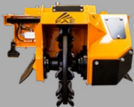
Stump cutter for the RCU75 remote controlled tracked carrier