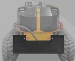
Chippers, sprayers, forestry winches, sweepers, mixing buckets, lifting forks, dozing blades, disc trimmers, trenchers and more