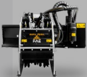
Fixed tooth road planer for the RCU75 remote controlled tracked carrier