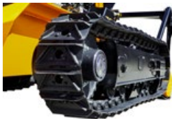
STEEL TRACKS (option)