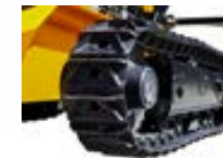
STEEL TRACKS (option)