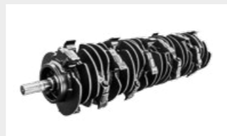
Bite Limiter rotor Special steel limiter rings control the depth of blade action (UML/HY/VT)