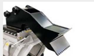
Customized attachment bracket with fixed thumb