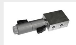
Diverter valve to control the opening and closing of the hydraulic door