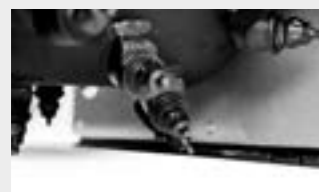
Teeth for working on concrete