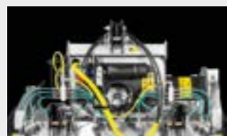
WSS Basic water injection system to reduce dust and cool the teeth