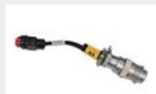
Wiring adaptors Wiring adaptors interface to allows a Plug & Play coupling with the most popular skid steers