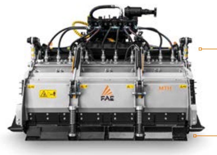
Kinematics for the adjustable frame, allows a perfect synchronization of the rotor when penetrating the soil

results in terms of breaking down material. The volume of the chamber increases based on depth with a reduction in fuel consumption and an increase in operating speed. The Hardox® wear-resistant counter blade and grid on the rear hood guarantee the desired granulometry of material processed.