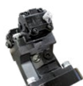
VT (Variable Torque) Motor with automatic torque management