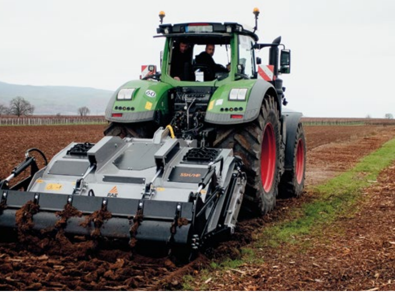
тоотн мн (side scraper)

Skids extension (SSH - SSH/HP 200 - 225 - 250)