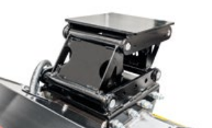
Attachment plate with self levelling device to adapt to all types of terrain