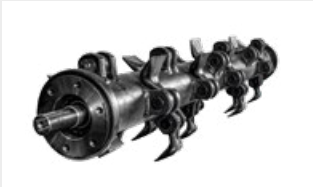
Possibility to have the rotor equipped with PML hammers or Y-flail