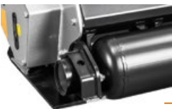
Stronger bearings for the support roller