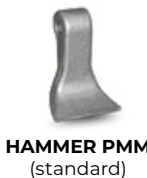
HAMMER PMM (standard)

Data refers to machine as standard. The technical data in this catalogue may be altered without prior notice.