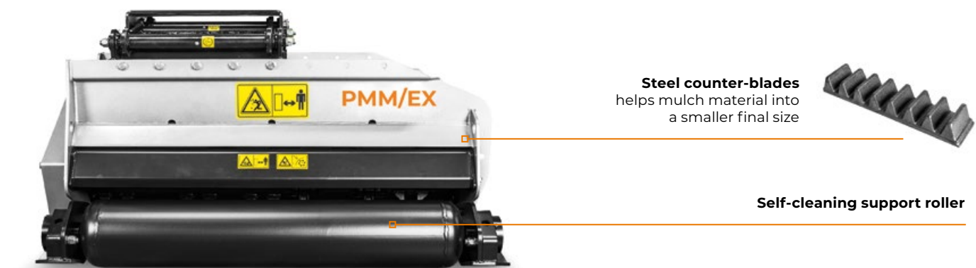
Enclosed machine body