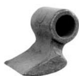
Hammer type FML