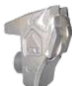
Tooth type C/SD