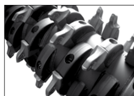
Rotor type SSL

The data refers to the machine without options.